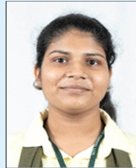
3 rd RANK (84%)